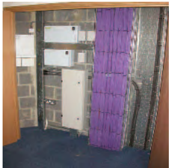
Data cable in tray with power cable running diagonally across the room.

So screening performance can be defined and measured, but what is the limiting factor, below which a cable couldn't be described as screened is not defined. Cable armour is considered as part of the protective earth circuit.