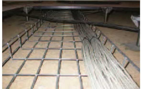
Data cable in tray with power cable running diagonally across the room.

"Two important properties in characterising screening effectiveness of cables are transfer impedance and capacitive coupling (admittance and impedance). These properties can be used to calculate the normalised screening attenuation in dB."